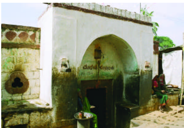
Above: The small temple at Saundatti used for Devadasi 'marriage' ceremonies.