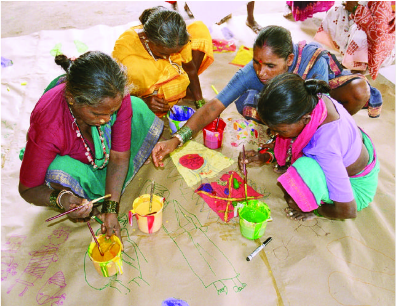
Jogini women paint the ceremony of the bride being dedicated, in all her finery, to the Goddess, as part of the workshop.