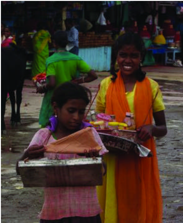
Young girls involved in temple commerce at Saundatti.