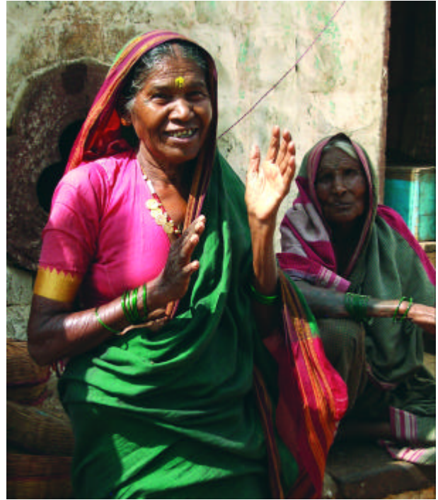
Devadasi, now elderly and 'retired', make a living by 'begging for sacred alms' outside a temple at Saundatti.