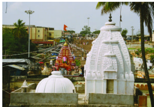
Above: A view of the temple complex at Saundatti.