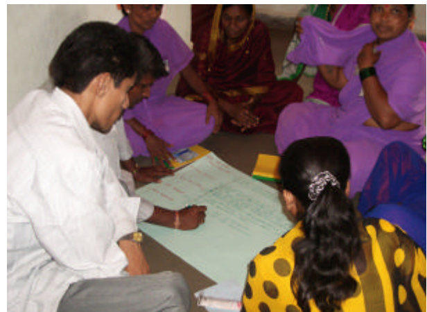
top: Mahbubnagar: the first exercise of the workshop - telling the story of going to the temple in celebration of the Goddess.