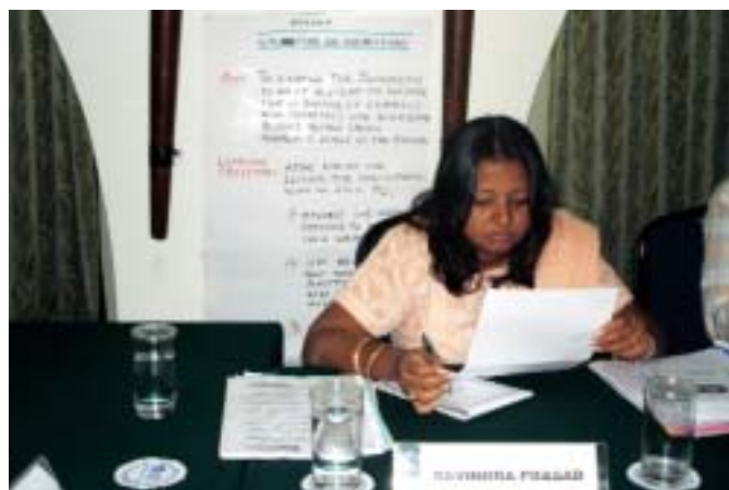
A journalist from India at the IFJ's training of trainers for Indian journalists, held in Hyderabad, June 24-27, 2006. The locally trained trainers then went on to deliver training to their peers on writing an HIV/AIDS story.

NGOs in India said only the transmission of HIV/AIDS received moderate coverage, while all other topics on HIV/AIDS had low coverage and were split on whether media provided adequate information on resources for PLWHA. In the