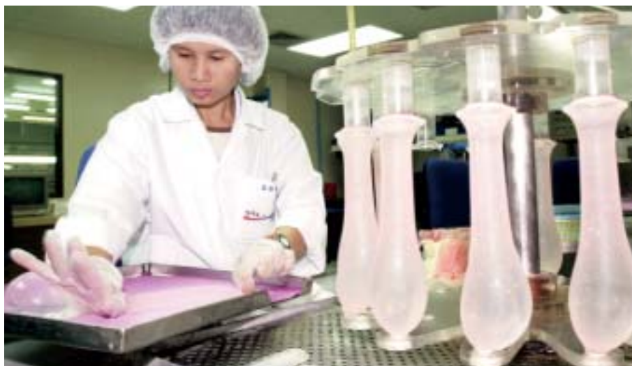
A technician at the Durex condom factory in Chonburi province, 70km south of Bangkok, makes a random test of condoms by putting in water to check for the leaking. Thailand is credited with bringing down the rate of HIV infection by 80 per cent after a massive awareness and condom distribution campaign in the early 1990s.

Molecules in the body that identify and destroy foreign substances such as bacteria and viruses. Standard HIV tests identify whether or not HIV antibodies are present in the blood.