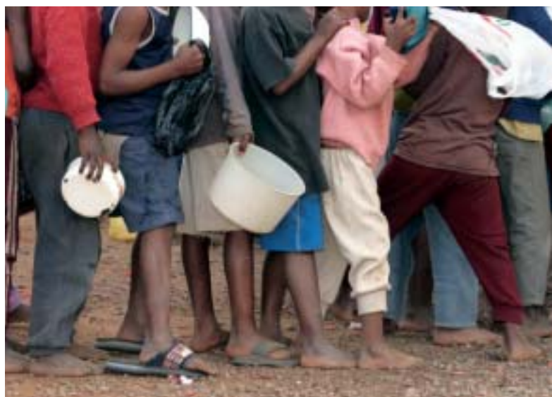
AIDS orphans queue for food at a kindergarten in Manzini, Swaziland. Stigma and discrimination continues to be a major problem for people with HIV. In many countries, HIV-positive people are shunned by their families, their community, their employers, and even their local health services. If a person agrees to be identified, it is important the journalist ensures they are aware of the potential consequences. – August, 2005.

It is not possible to look at someone and know whether he or she is HIV positive. A blood test can reveal the presence of the