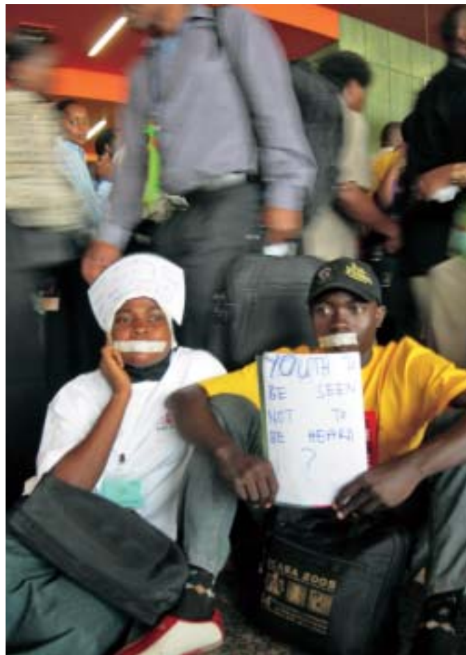
Young African AIDS activists, their mouths taped with bandages, protest in the main hall of the 14th International Conference on AIDS and Sexually Transmitted Infections in Africa (ICASA) in Abuja. The youths believe their input into discussions of the AIDS crisis is being ignored. The media has an important role in ensuring the voices and opinions of youth, women and people living with HIV and AIDS are heard loud and clear in media reports on HIV/AIDS. – December, 2005.

Christopher Warren President International Federation of Journalists