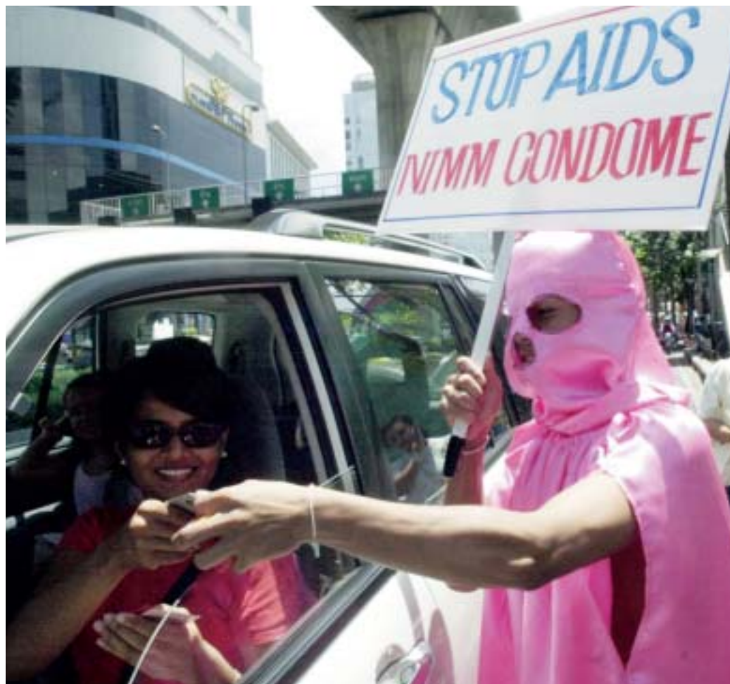
A man dressed as a condom passes out free condoms to a driver in Bangkok during a campaign promoting the awareness of AIDS. Less than 20 per cent of people at risk of contracting HIV have access to preventative measures such as condoms. – November, 2004.