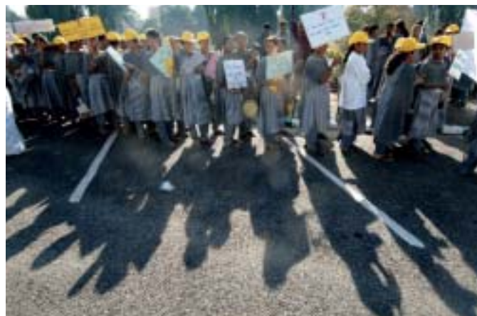
Indian students with placards take part in an HIV/AIDS awareness rally in Bangalore to mark the World AIDS Day. According to UN figures, India has the second highest number of HIV/AIDS infections of any country in the world after South Africa. – December 1, 2005.

– Source: Henry J. Kaiser Family Foundation, Reporting Manual on HIV/AIDS: HIV/AIDS Reporting , December 2005, http://www.kff.org/hivaids/upload/7124-02.pdf