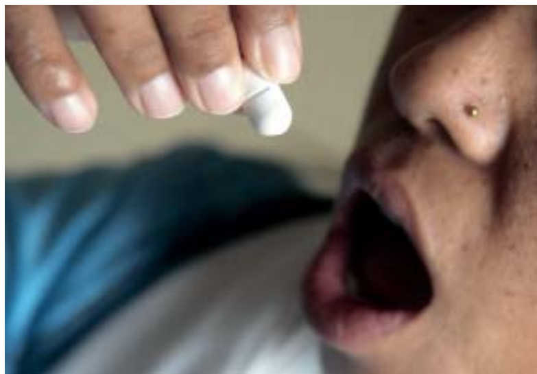
A young girl at the Maiti Nepal Rehabilitation and Orphanage home in Kathmandu, Nepal. There is now a range of drugs for treating HIV and fighting the virus. These are technically called antiretroviral drugs, because HIV is a type of virus known as a retrovirus, but they are more commonly called antivirals. – July 8, 2004.

Also referred to as crypto, this is an intestinal infection spread through contact with water, faeces or food that have been contaminated with a common parasite called Cryptosporidium . Symptoms include diarrhoea, nausea, vomiting, weight loss and stomach cramps. Infections can last much longer than the usual two weeks in people with HIV and can be life-threatening. There are no medications that treat or prevent crypto, but there are treatments to control the diarrhoea caused by the infection.