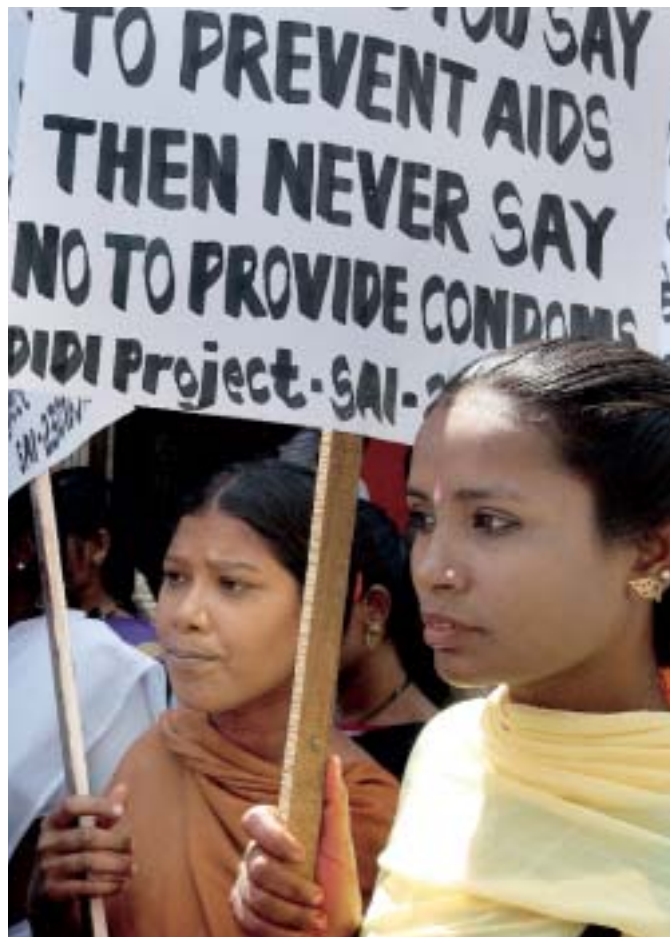
Indian women hold placards as they demonstrate against the Mumbai District AIDS Control Society in the restrictions of handing out condoms in Mumbai (Bombay), on International Women's Day in 2004. An ever-increasing proportion of women are affected by the epidemic. In 2005, UNAIDS found that 17.3 million women were living with HIV, with 13.2 million living in sub-Saharan Africa. The impact on women is apparent also in South and South-East Asia, where more than 2 million women now have HIV. – March 8, 2004.

Central to the continued prevention of the spread of HIV and other blood-borne viruses such as hepatitis C, harm minimisation is a pragmatic approach that recognises the reality