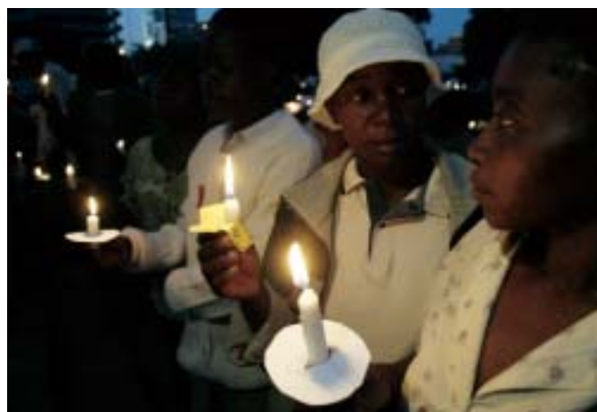
People in Zimbabwe gather in a ceremony at the Town House in Harare, in honour of people who have died of HIV and AIDS. HIV stands for Human Immunodeficiency Virus – the virus that can cause AIDS. A person who is infected with HIV does not necessarily have AIDS. However, all people with AIDS have HIV. AIDS is not a single disease, but a spectrum of conditions that occur when a person's immune system is damaged after years of attack by HIV. Because of the vital role media plays in educating the public, it is important that journalists understand the difference between HIV and AIDS. – May, 2006.

Use: Person living with HIV or AIDS, HIV-positive person Don't use: AIDS patient Use “AIDS patient” only to describe someone who has AIDS and who is, in the context of the story, in a medical setting. Most of the time, a person with AIDS is not in the role of patient.