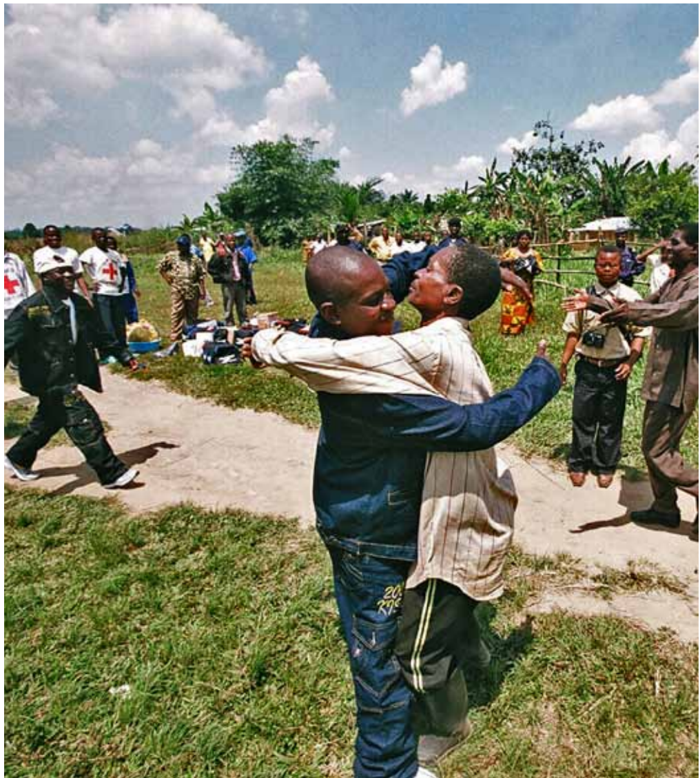
Congo-Kinshasa, South Kivu province, Shabunda. Seven demobilized child soldiers are reunited with their families.