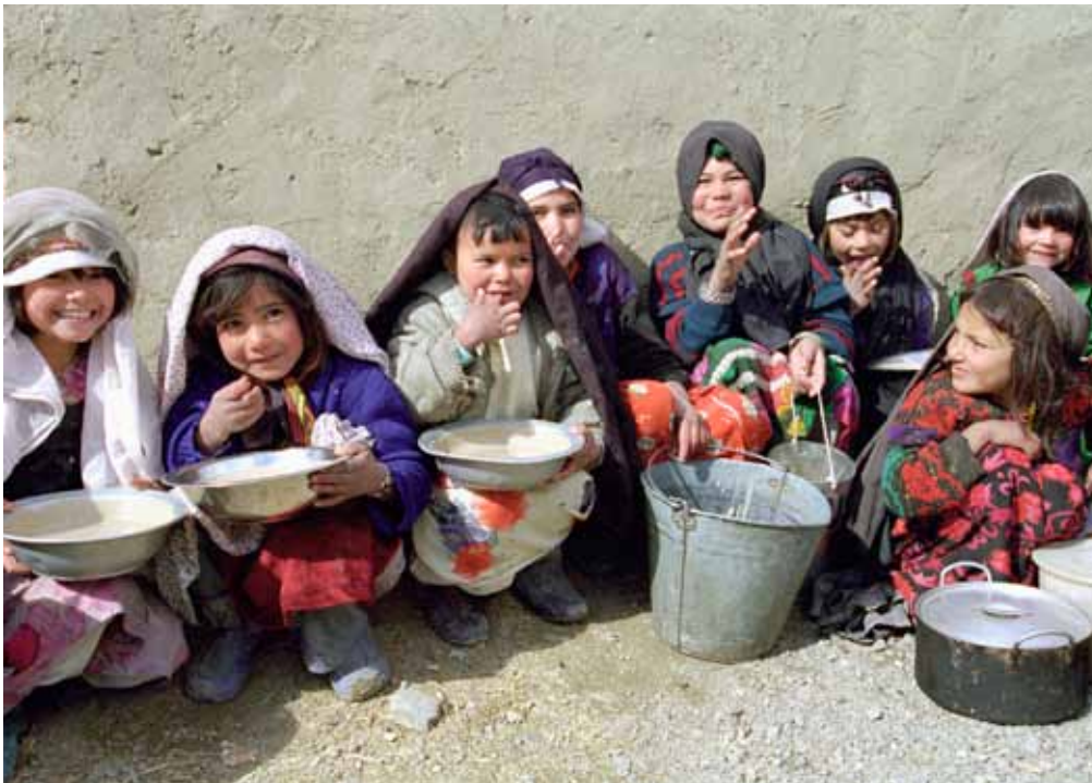
Afghan children waiting in line outside of the kitchen for the "wet feeding project" which is funded by the World Food Programme (WFP) in Maslakh IDP Camp, situated near the western Afghan city of Herat, 3 February 2002.

Primary responsibility for assisting internally displaced persons rests with national authorities. 83 Yet, when they are unable or unwilling to do so, they may not arbitrarily withhold consent to offers of assistance from international humanitarian organizations, but are