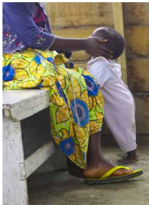
North Kivu province, Goma, 14 August 2006. Cepac Cashero clinic for women victims of sexual violence.

The CRC and its optional protocol on sex trafficking affirm unequivocally that children must enjoy protection from torture, cruel,