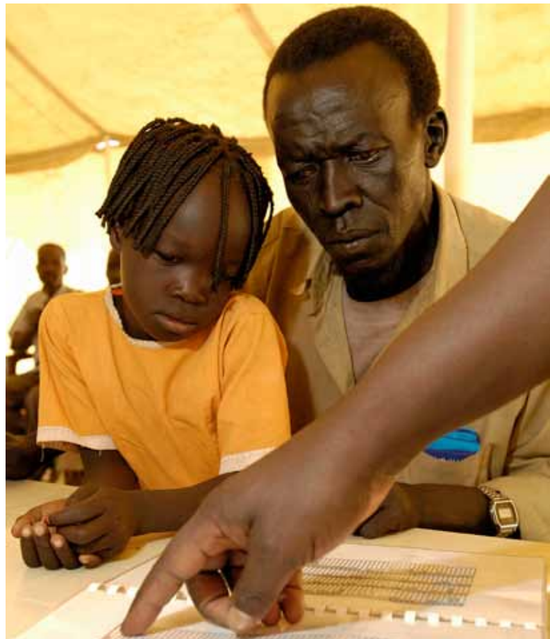
A father and his daughter are looking for information about their hometown prior to the start of the registration of the IDPs in Khartoum, where an estimated two million IDPs have been residing. 21 November 2006.

Special efforts should be made to ensure the full participation of internally displaced persons in the planning and management of their return or resettlement and reintegration. This necessarily must include the participation of children and youth (see chapter on Participation). It is important to consider