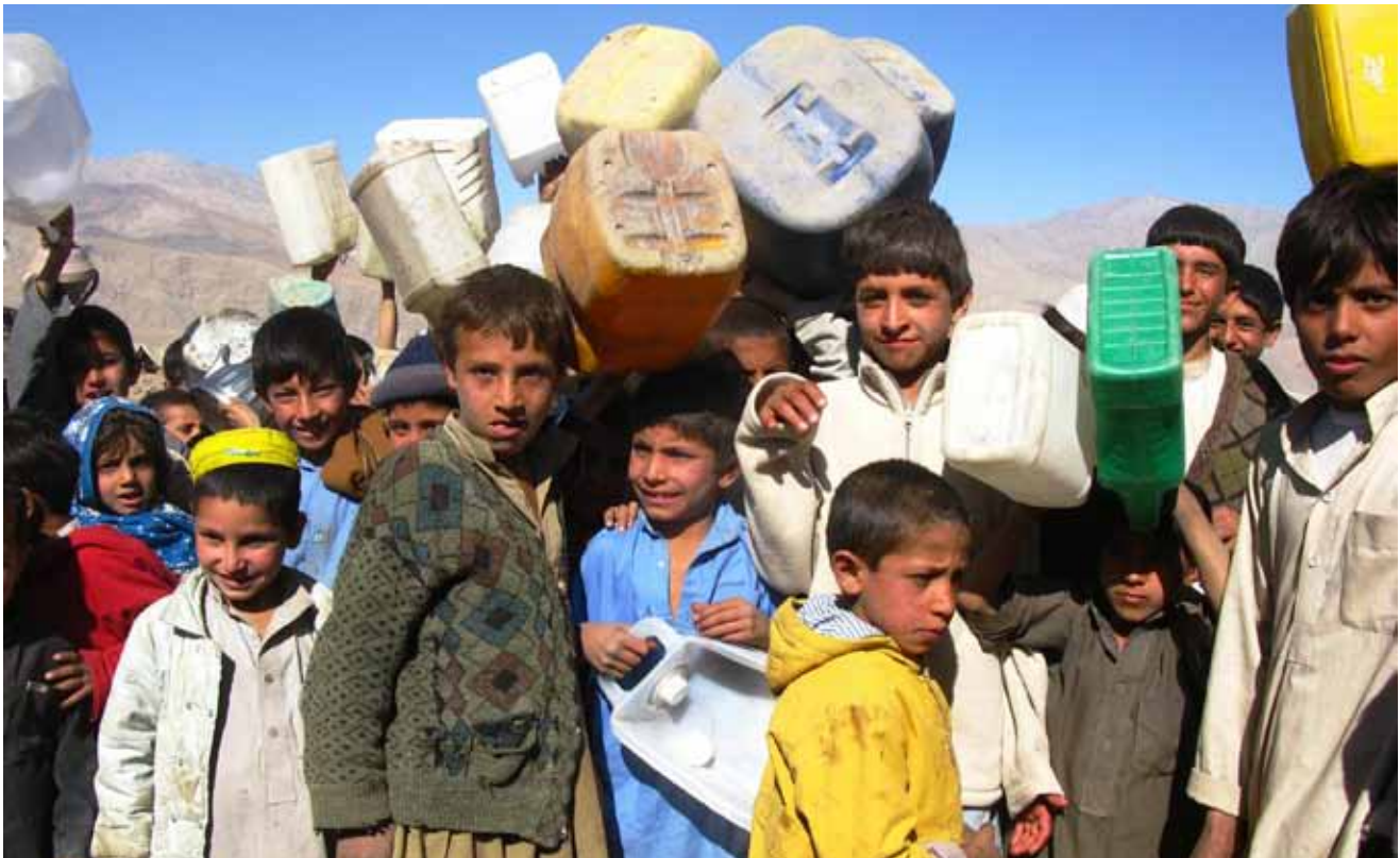
IDP children in the east of Afghanistan.