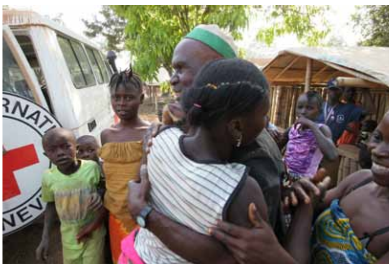
Liberia, Lofa county, Poluwo. A father is reunited with his daughter thanks to the Family Links Network.

In Sierra Leone, it is believed that as many as 10,000 children were separated or orphaned due to the war, with forced displacement cited as one of the major causes of separation. In 1998, a group of 200 orphaned children were found living alone in the forest, having been displaced from their orphanage. In Freetown, more than 3000 children were living on the streets, and during the Revolutionary United Front (RUF)/Armed Forced Revolutionary Council (AFRC) assault on the city in 1999, street children were detained as suspected rebels and abused by Economic