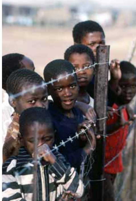
Group of children inside an IDP camp.

OFFICE OF THE SPECIAL REPRESENTATIVE OF THE SECRETARY-GENERAL FOR CHILDREN AND ARMED CONFLICT