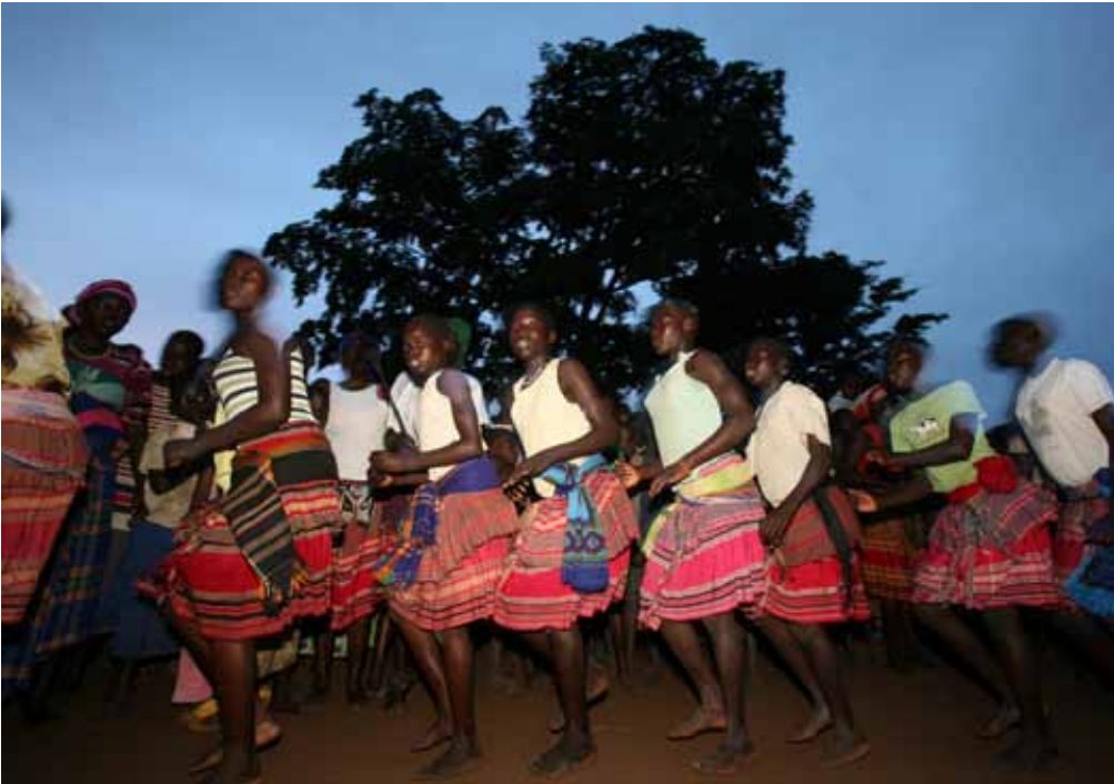
Young girls entertain guests at Namokora IDP camp, Kitgum District, northern Uganda, 15 May 2007. Girls in northern Uganda are highly vulnerable to human rights abuses, which makes international law protecting them all the more critical.