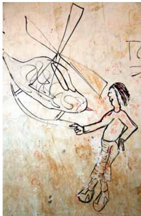
Child drawing depicting armed violence. Uganda, 8 June 2006.

Following displacement, many children continue to live in an environment characterized by violence and fear. Violence breaks out in families due to high stress levels. Girls and boys are often sexually abused by people