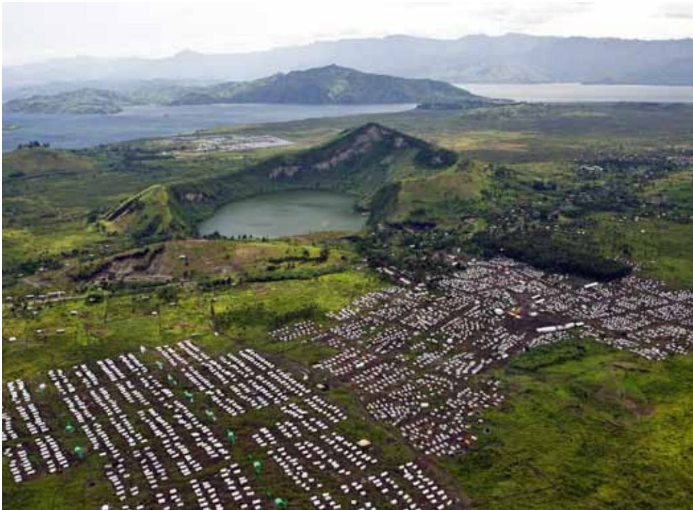
Aerial View of IDP camps Mugunga and Bulengo in North Kivu, DRC, 4 April 2008.