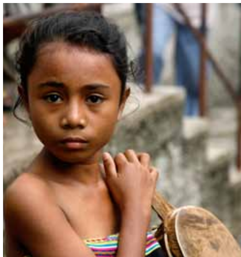
A young Timorese girl at the Motael IDP camp, 14 December 2007.