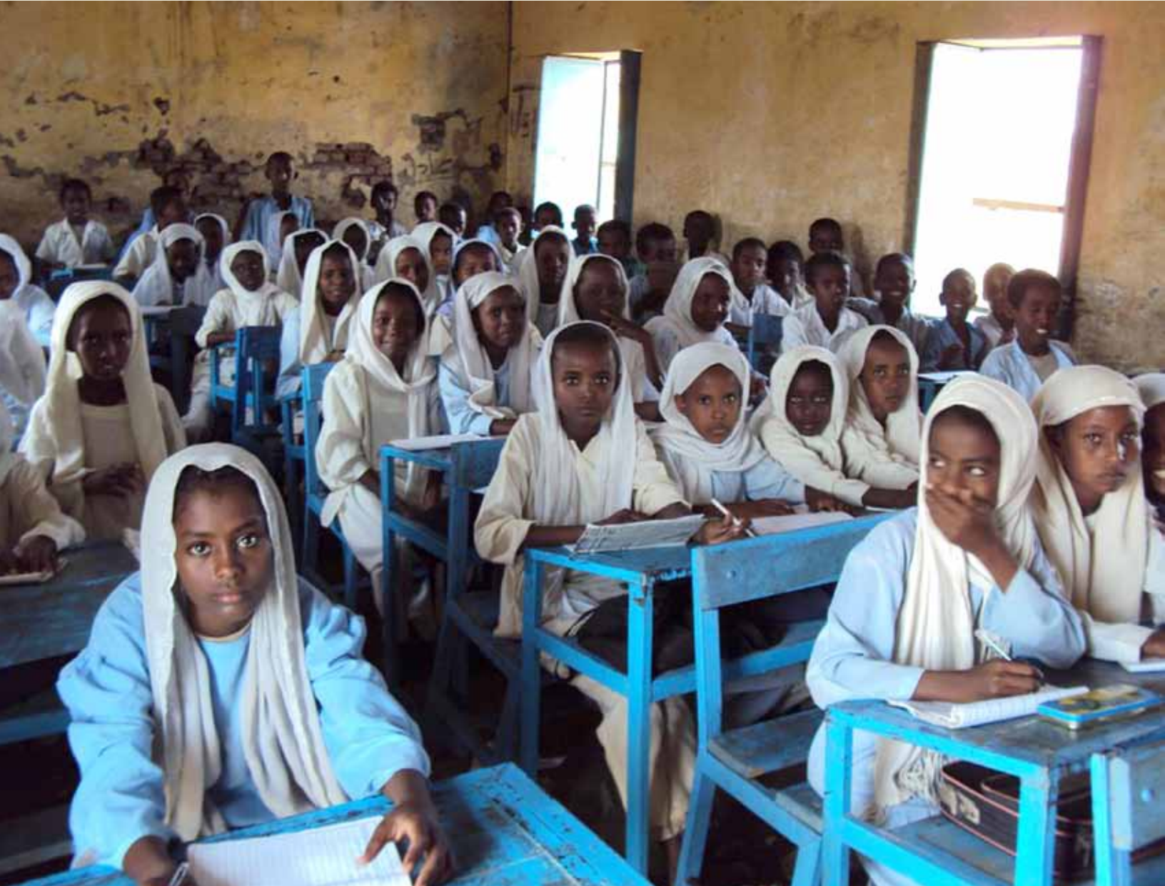
Shagarab Camp school. 6,000 of a total of 15,000 children in eastern Sudan's 12 camps do not have education opportunities—the camp's schools don't have space for them.