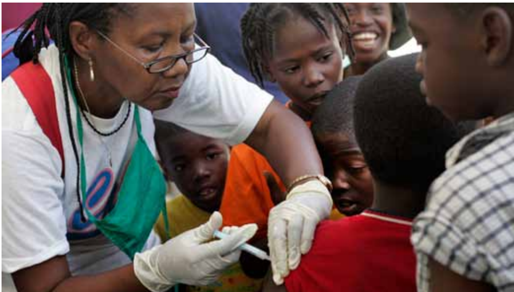
Cuban doctors administer diphtheria and tetanus vaccinations provided by the World Health Organization (WHO) to children at Delmas 33 IDP camp in Port-au-Prince, 16 February 2010.

The right to life is the most fundamental human right. 58 An important corollary to this is the right of every human being to dignity and physical, mental and moral integrity. 59 These rights also find reflection in the range