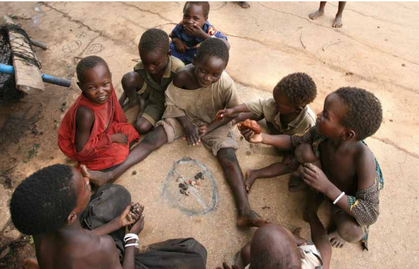
Children play at IDP camp in Arare, 12 km from Jamame, southern Somalia, 15 December 2006.