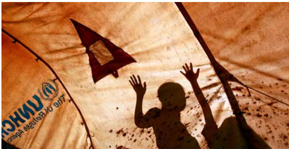
IDP's, seen here inside a UN Refugee Agency (UNHCR) tent, in Timor-Leste, 3 July 2008.