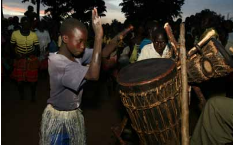
A group of young boys drumming for dancers at Namokora IDP camp, Kitgum District, northern Uganda, 15 May 2007. The war has subsided and internally displaced people find time to play their traditional instruments.

The Guiding Principles on Internal Displacement strongly emphasize the issue of non-discrimination against displaced persons on any basis, including “race, colour, sex, language, religion or belief, political or other opinion, national, ethnic or social origin, legal or social status, age, disability, property, birth or on any other similar criteria” (see chapter on Non-Discrimination).