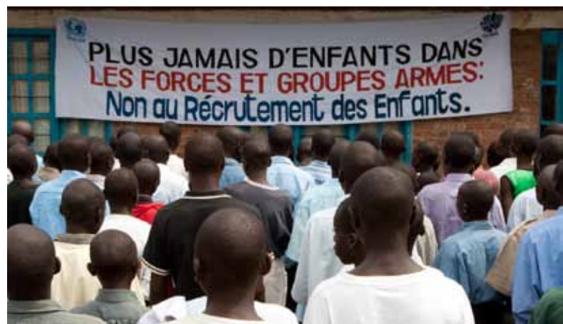
"Never again child soldiers in armed forces and groups". DRC, 18 April 2009.

Recruiting or using children under the age of fifteen years as soldiers or allowing them to participate in hostilities is expressly prohibited by the Convention on the Rights of the