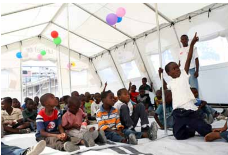
UNICEF and Danish Red Cross introduce “School in a Box” in Haiti IDP Camp, 25 February 2010.

The right to education continues to apply in armed conflict. International humanitarian law affirms this right in times of conflict, including occupation and in the event of evacuations. 165 Deliberately targeting schools or hospitals by armed attack is prohibited under the general legal principle that parties to a conflict must, in the absence of military necessity, distinguish civilian objects from legitimate military objectives and protect them against the consequences of military operations. 166 This is a customary norm of international law applicable in all conflict situations. 167 The deliberate targeting or destruction of a school (or hospital or other civilian object) may amount to a grave breach of the laws of armed conflict. 168 Attacks against schools also may constitute crimes against humanity and war crimes, for which individuals can be prosecuted and punished under the Rome Statute of the ICC. 169 Attacks against schools and hospitals consti-