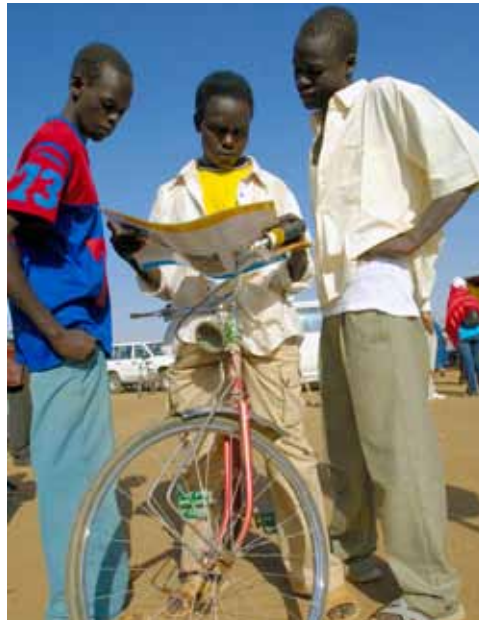
Young IDPs read information leaflets distributed by the International Organization for Migration (IOM), NGOs and UN staff as part of the third Information Campaign Day activities for IDPs at the Haj Yousif /Hey Al Baraka camp, Sudan, 4 November 2006.

The right to participation is closely linked to fulfilling the right to information 47 a key prerequisite for children's participation to be relevant and meaningful. This is especially important during return and reintegration, as children may not remember their old homes or may have been born in an IDP camp.