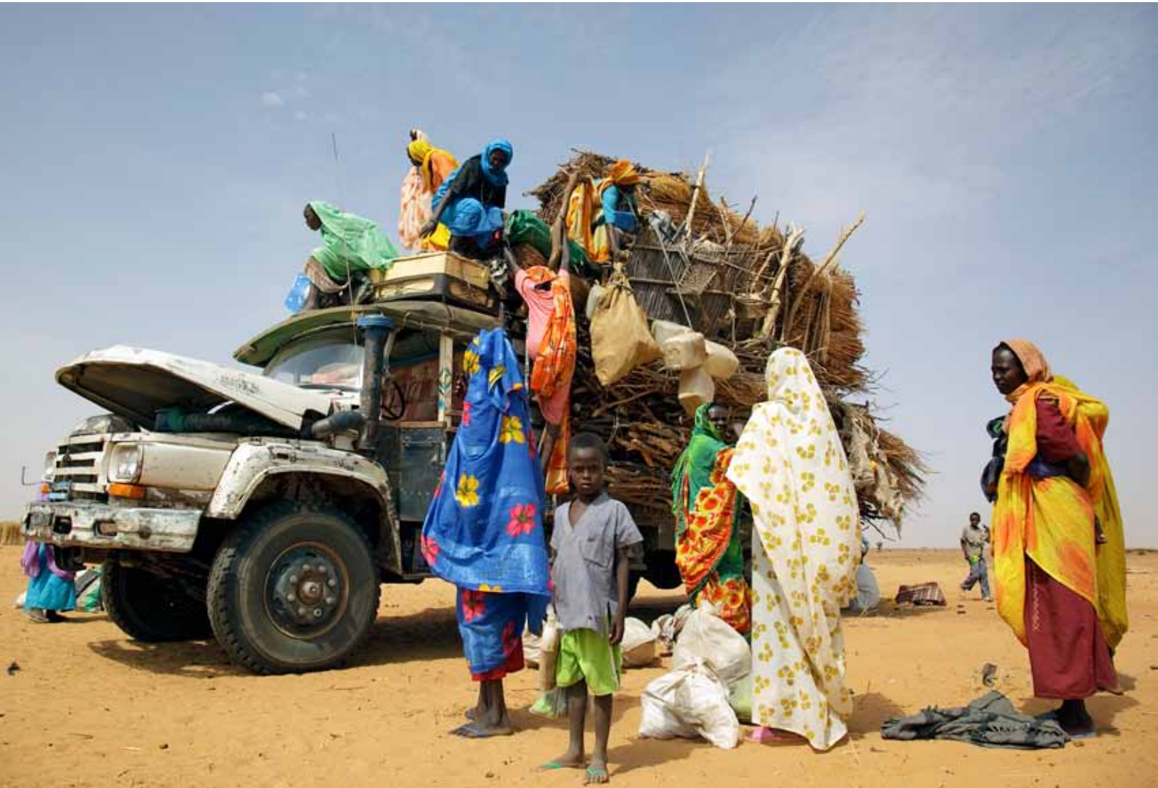
IDPs arrive at Zamzam Camp, Sudan, 4 June 2009.