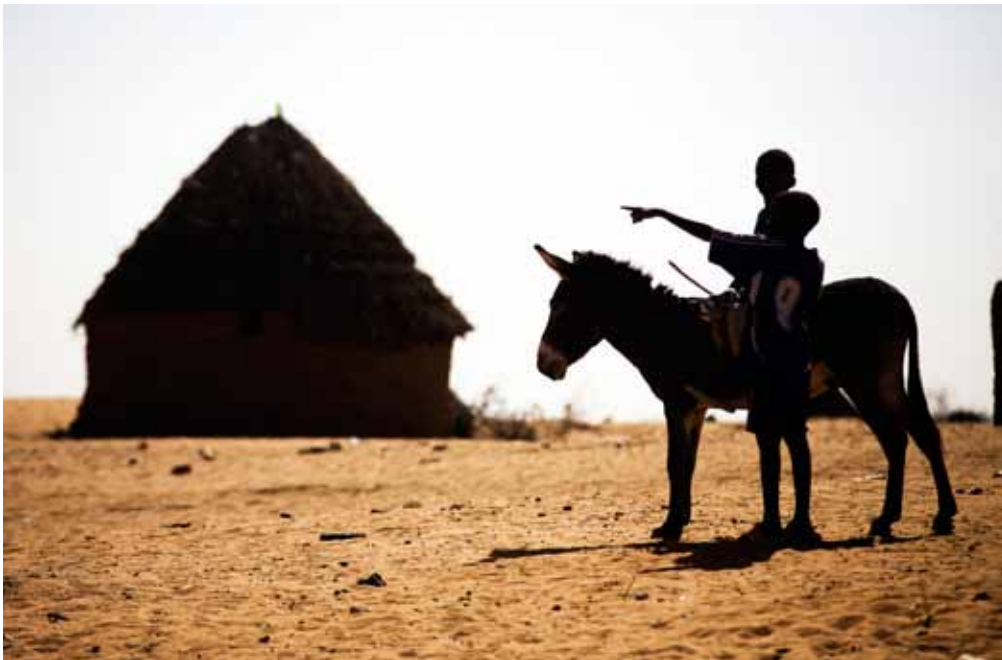
Former Sudanese IDPs return to their homes in Swilinga village, Darfur. 3 February 2010.