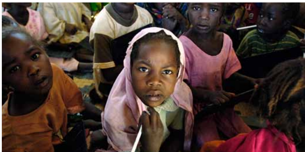
A group of children are at the International Rescue Committee kindergarden at the Hamadiya IDP camp in Zalingei, West Darfur, 31 January 2007.