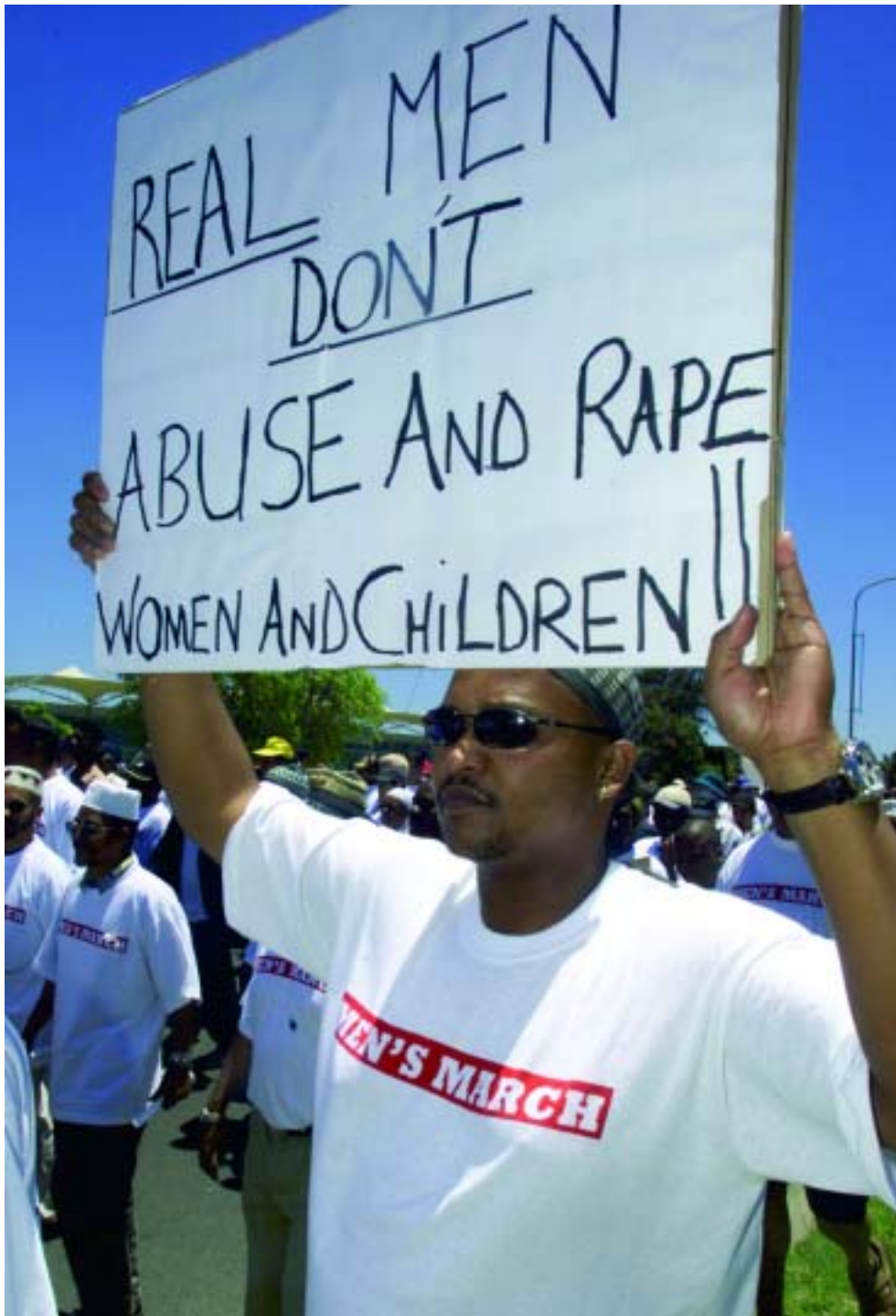
Marchers demonstrating in Cape Town, South Africa, about violence against women and children, November 2001.