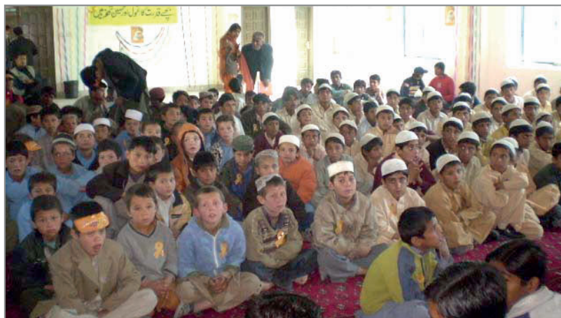
SEHER Pakistan - a WWSF coalition member organization and Recipient of the WWSF 1st Prize for prevention of child abuse 2007

WWSF especially encourages the participation of children and young people . "It is essential that their views are taken into account when formulating abuse and violence prevention and elimination policies. Research shows that most children suffering violence do so silently, and therefore special efforts are required to make it possible for them to feel safe enough to discuss violent incidents...". www.violencestudy.org