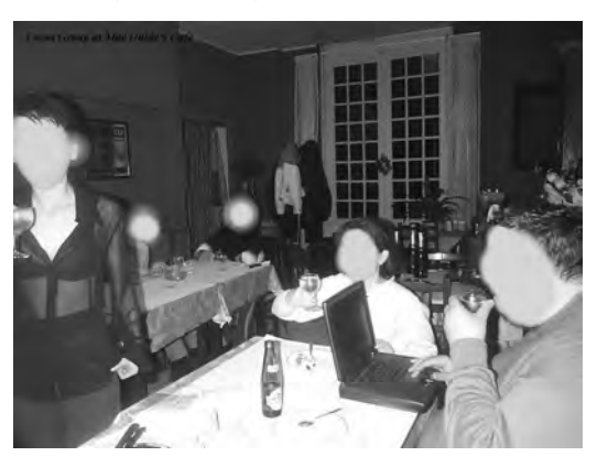
Figure 2.3 Street-based focus group meeting