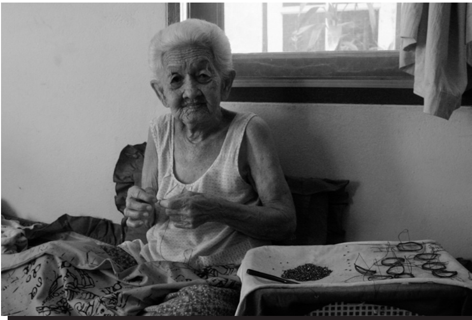
Sub-contracted home-based worker beading in Bangkok, Thailand.

of orders, and/or wages, depending on their employment arrangement with their workforce. In Table 3, more than half (55%) of the industrial outworkers – sub-contracted home-based workers – reported that their work orders had been cut and that the volume of their production had fallen significantly in the preceding six months. Work orders were fewer, and smaller, and in some cases, workers were not being paid on time for their work. One respondent in Thailand reported that her employer had not paid her at all in the previous six-month period. Another reported, "I used to get orders for slippers from Phuket and Sa Mui, about 600-800 pairs. Now I have no orders so I have to produce and sell by myself." 9