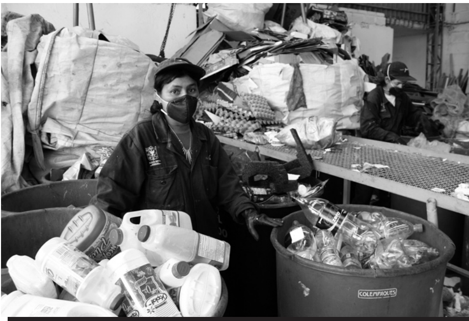
Waste picker sorting material at the Alqueria Recycling Centre in Bogotá, Colombia.

However, a higher number of informal workers does not mean they are thriving. On the contrary, respondents were clear that they faced greater absolute numbers of competitors for fewer customers over the same period, and this had decreased their revenue substantially. Of the street vendors, 80 per cent reported that they had experienced increased direct competition from new vendors selling similar goods. Over two-thirds (655) of home-based workers, who are most likely to work in isolation, reported increased direct competition. One home-based worker reported that she used to sell her products at 199 Baht (USD 6) but her new competitors were willing to sell as low as 59 Baht (USD 1.7) and she now faces a 50 per cent decrease in her income. Some of these new competitors were migrant workers who were willing to sell at the lowest prices.