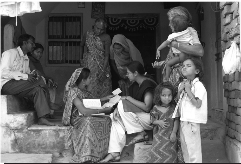
Consultation with a family of informal workers in India.

Much like formal counterparts, informal workers and enterprises are experiencing decreasing demand for goods and services, rising cost of inputs, and increasing pricing volatility for goods sold. In contrast to formal workers, informal workers are experiencing increasing competition and swelling ranks of their trades. Contrary to conventional wisdom, expanding employment in the informal economy does not mean informal workers are thriving during the recession. Unlike some of their formal counterparts, informal firms and informal wage workers have no ‘cushion’ to fall back on and have little option but to keep operating or working through these economically challenging times.