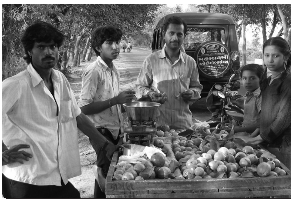
Street vendors selling their produce in Ahmedabad, India.

Individual waste pickers are the most vulnerable as they do not have any supportive organisation or network to turn to. In Pune, waste pickers participating in this study are involved in highly organised waste-recycling schemes and some sell waste through their own co-operative. 48 The drop in prices of various recyclable goods reported by these respondents ranged from five to seven per cent. In Latin America, where a lower percentage of the sample was involved in these kinds of recycling schemes, the drop in prices of various recyclable goods over the same period ranged from 42 to 50 per cent. Whether this contrast is due to the level of organisation remains an empirical question that needs further investigation.