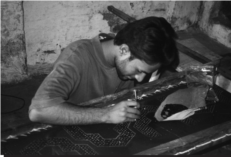
Own-account home-based worker doing needlework in Ahmedabad, India.

workers. Laws that recognise organisations vary considerably from country to country. The first step is the need to recognise the existence and importance of member-based organisations of informal workers by all levels of government but also by international bodies like the International Labour Organisation.