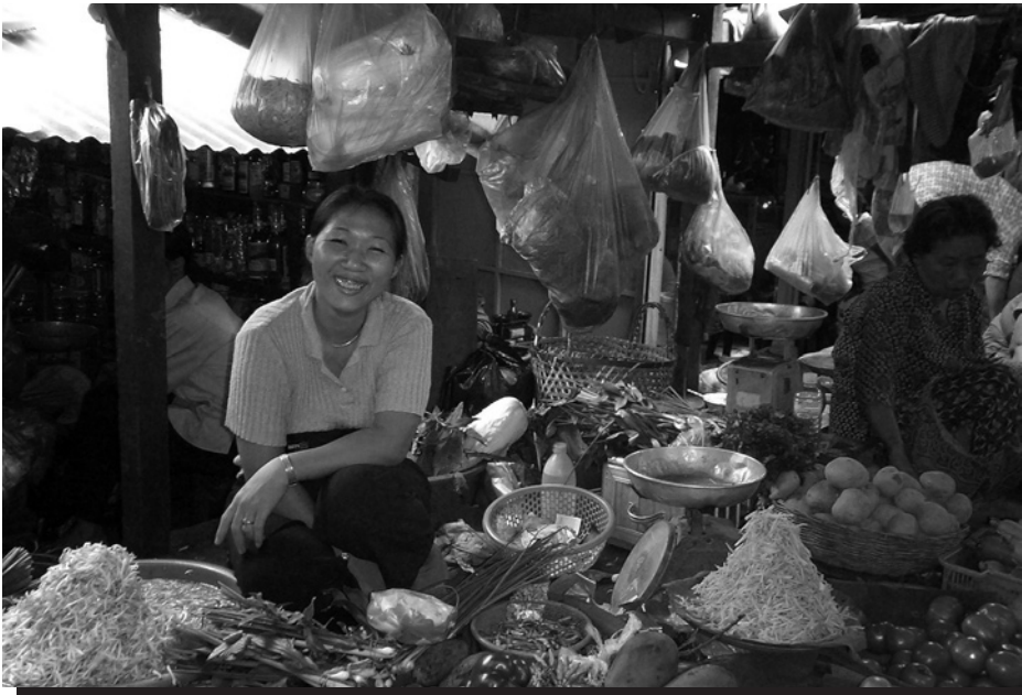
Street vendor selling food at a stall in Thailand.

Finally, special thanks are due to the 164 informal workers who participated in this study. The project partners and coordinator are deeply grateful to them for their time, their contributions, and their candour.