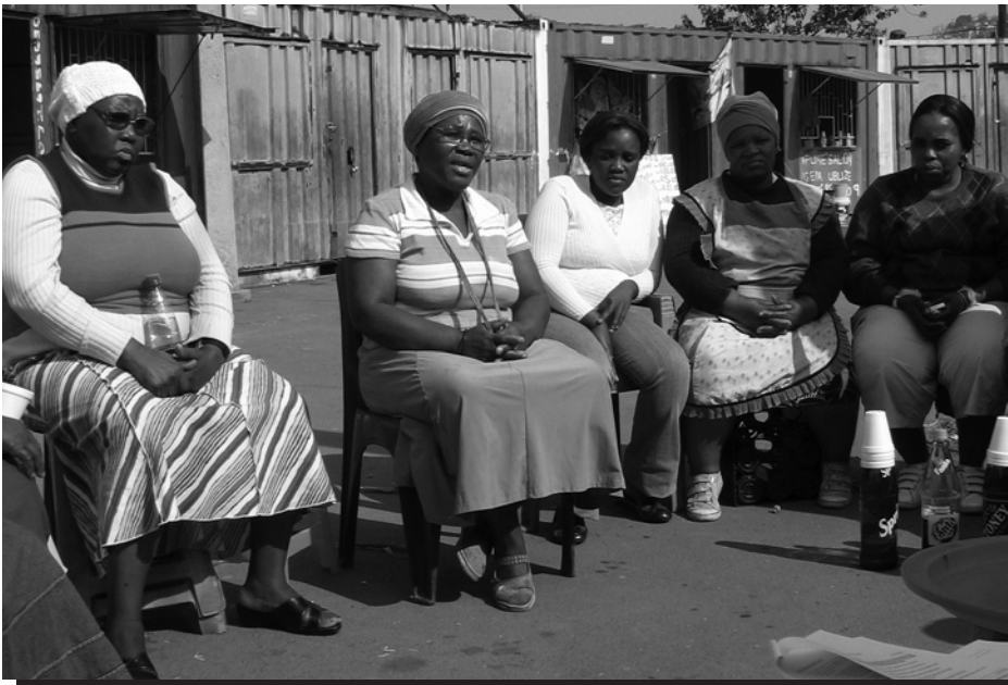
Street vendors voice their demands in Durban, South Africa.

Informal workers feel that there are a number of specific actions that governments can take to help alleviate their hardship during the crisis. Emergency measures such as soup kitchens or community kitchens will provide meals and food staples at subsidised rates to informal workers and their families, who are struggling to feed themselves. Likewise, workers demand that governments take action to ensure that children are not dismissed from school if their parents are struggling to pay fees during the crisis. Informal workers also propose that shelters are provided for those facing eviction, as well as new migrants internally displaced by economic crises.