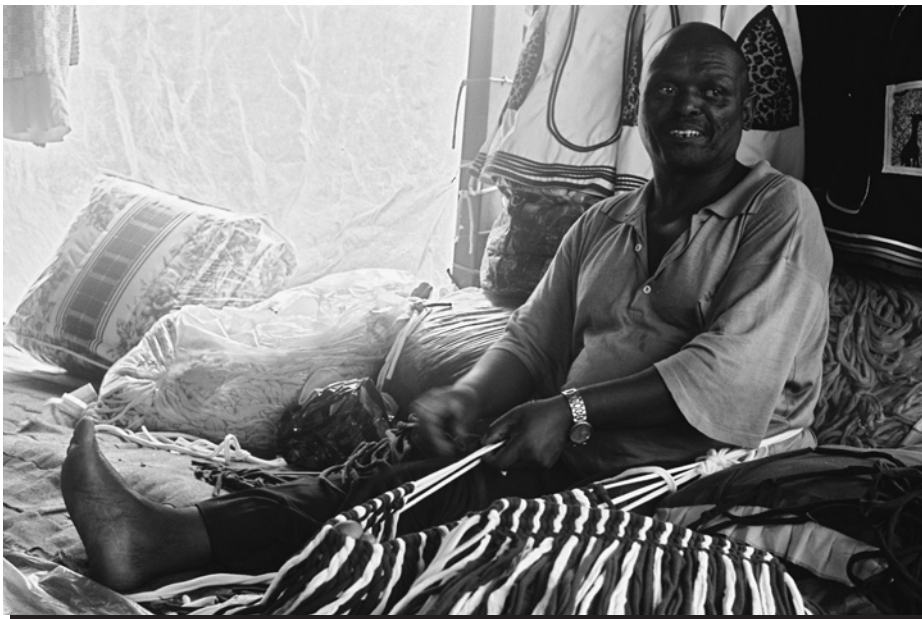
Street vendor preparing his goods in Durban, South Africa.

waste recycler felt that he and other waste pickers were victims of a global “game”, and that entrepreneurs were “playing” with the price of waste materials. The feeling that they were being subjected to forces beyond their control translated into a sense of powerlessness among some workers. A waste picker in Bogota revealed, “My feeling is frustration... Much more effort is required every day to get a result that is much lower than what it was previously. Very little can be done.” 62