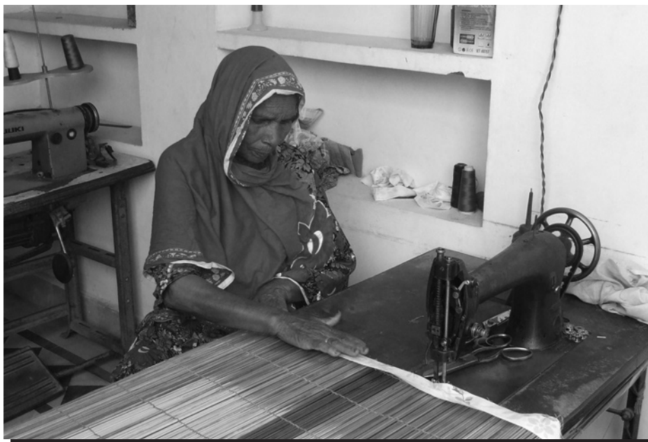
Home-based worker making reed mats in Kasur, Pakistan.

The current global economic crisis has hit the global workforce very hard and few economic actors have been insulated from the shocks. Initially, media and policy attention was confined to analysis of the global financial sector and the macroeconomic situation. Attention has now turned to the impact of the crisis on the real economy in both the developed and developing worlds, and many are concerned that the crisis could gravely afflict emerging markets and developing countries, effectively destroying the economic progress of recent years. The developing world is home to a major proportion of the global poor, for whom the consequences of the crisis could be especially severe, given their slim margins for survival in the best of times. 1 And yet, as the crisis transformed into a recession, and the recession spread across borders, the informal economy has remained largely absent from public and media attention. This is a particularly glaring omission given that a majority of the world's poor and vulnerable workers rely on the informal economy as a source of employment and income.