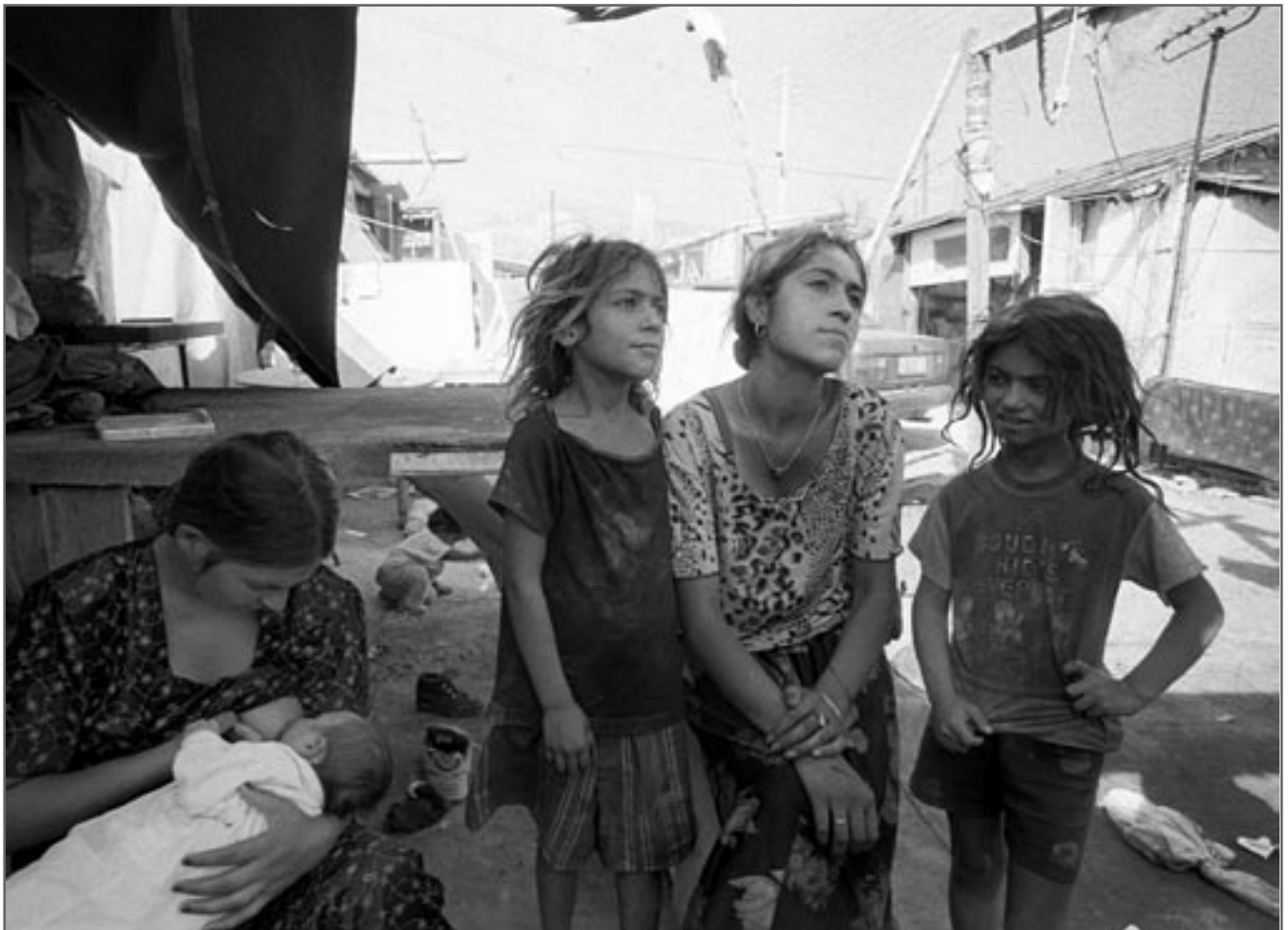
Life conditions of Albanian families, Athens.

The EU approach to humanitarian interventions recognises that special care must be taken to protect children in emergency situations who are especially vulnerable, and thus all programmes are to have a special focus on children's welfare. Whilst such measures can contribute to the protection of children from trafficking there is also a need for specific measures, both during the emergency itself or in the rehabilitation period, which are not currently present in EU policy.