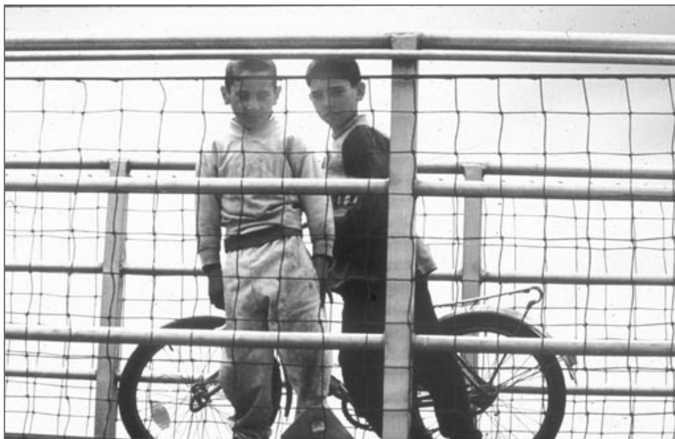
Boys being forced to steal by criminal gangs, Hamburg

In addition, the current approach focuses extensively on prosecution of traffickers and so where provisions exist for victim protection they tend to be relevant only to those victims who choose to testify against their traffickers. These tend to be adults. Any instrument that is to contribute to the fight against child trafficking must include a series of measures for the protection of any child that is identified as a victim of trafficking regardless of whether or not he or she chooses to be involved in criminal proceedings.