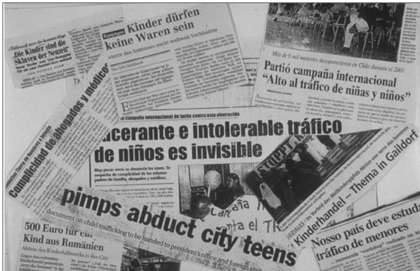
Child Trafficking is becoming an increasing concern in public opinion

This paper builds on the extensive field experience of Terre des Hommes in the promotion and safeguarding of children's rights through projects relating to