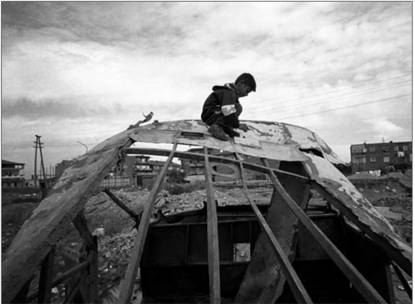
Kid playing in the surrounding of his house, Albania.