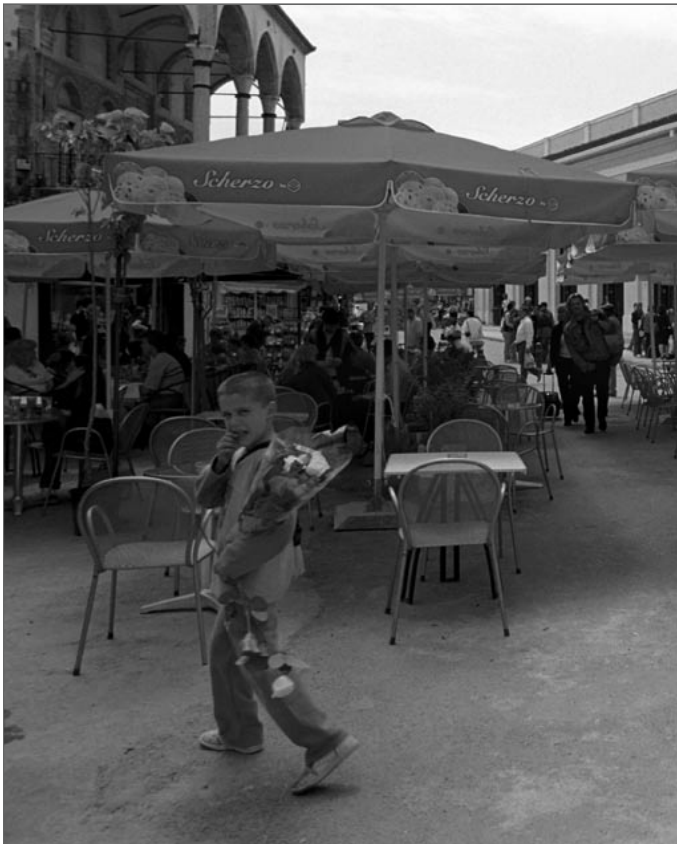
Boy selling flowers in a cafe. Construction to the right hand side and in the background for the Olympic Games 2004. Monastiraki Athens.